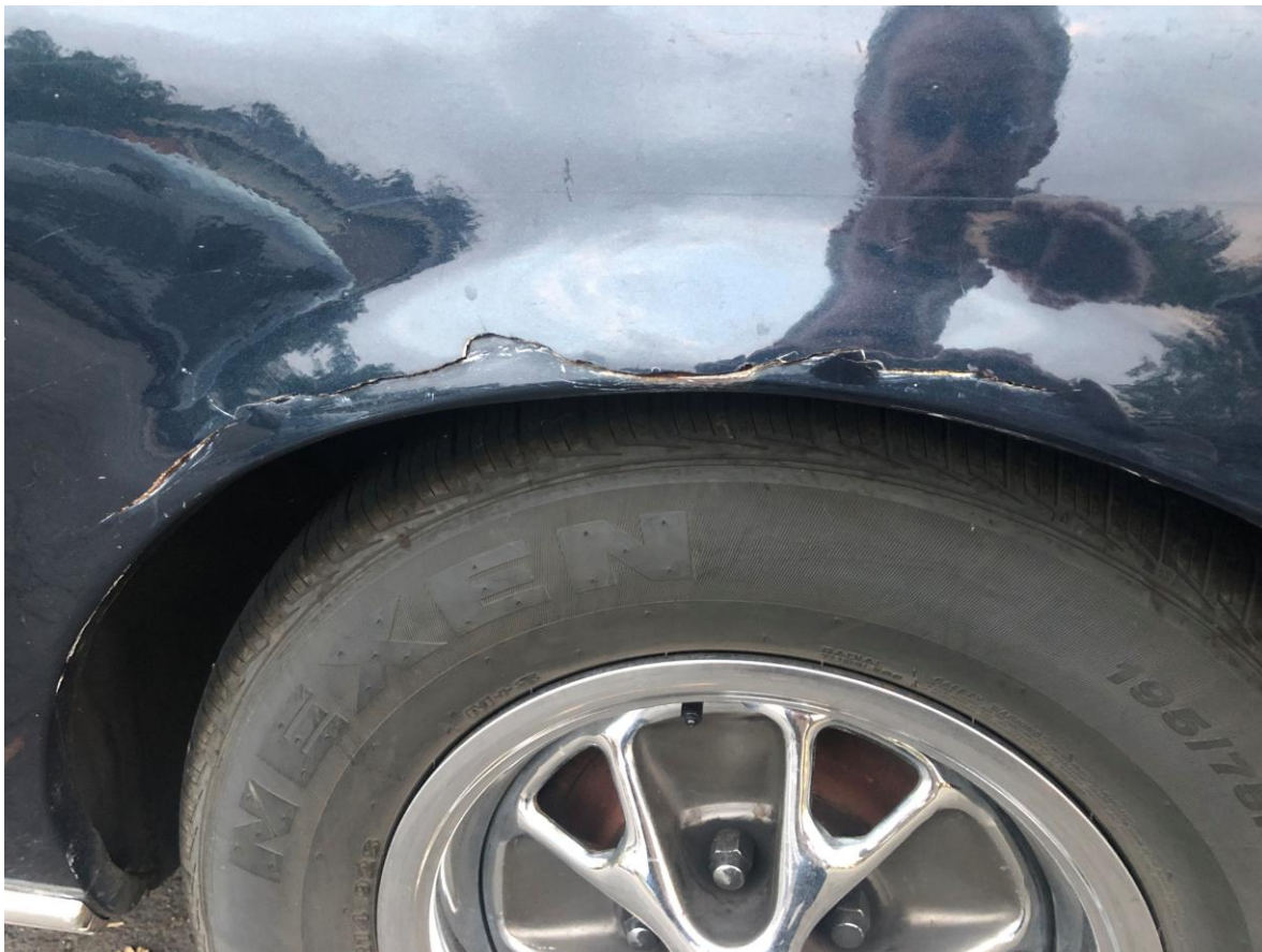
Top of left rear wheel well